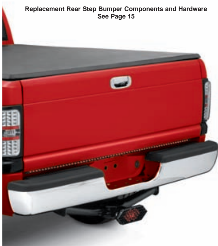
Replacement Rear Step Bumper Components and Hardware See Page 15